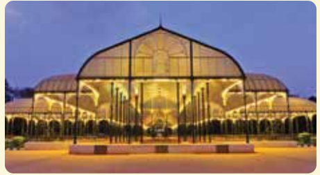
Lalbagh Botanical Garden